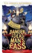
Danger at Dead Man's Pass 2021