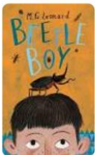
Beetle Boy 2016