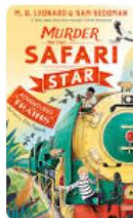
Murder on the Safari Star 2021