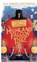
The Highland Falcon Thief 2020