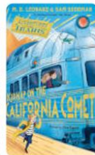
Kidnap on the California... 2020